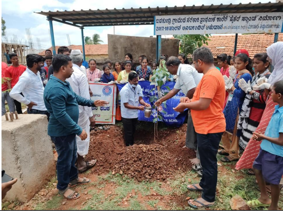
Tree Plantation at village Goudwad