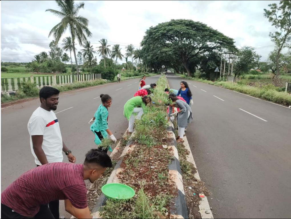
Weed Cleaning near Badakundri Village